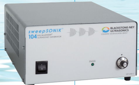
sweepSONIK 3 104 kHz