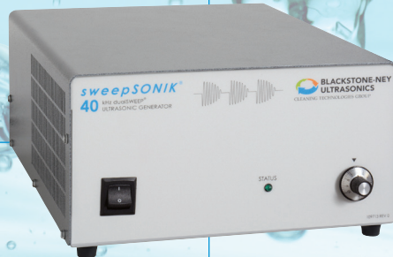
sweepSONIK 3 40 kHz