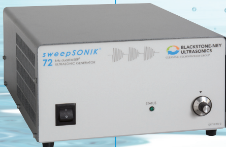
sweepSONIK 3 72 kHz